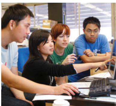
From top: Student at the UCLA Herb Alpert School of Music.

Students at the UCLA Samueli School of Engineering, home of the first node of the Internet and the first reverse osmosis membrane, among many other breakthroughs.